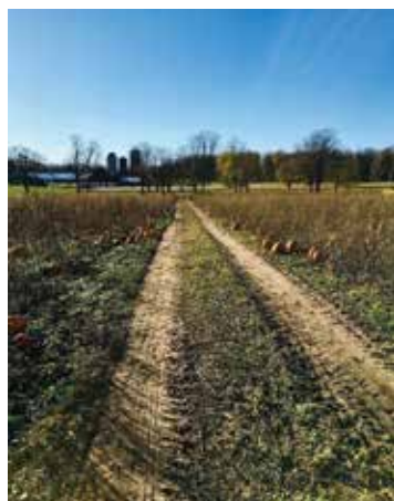
Region 2 adoptive families enjoyed a beautiful day in Gaylord picking pumpkins at Fleming Farms.