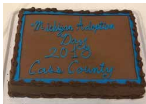
Region 4 celebrated National Adoption Day with new adoptees and their families at Cass County Family Court.