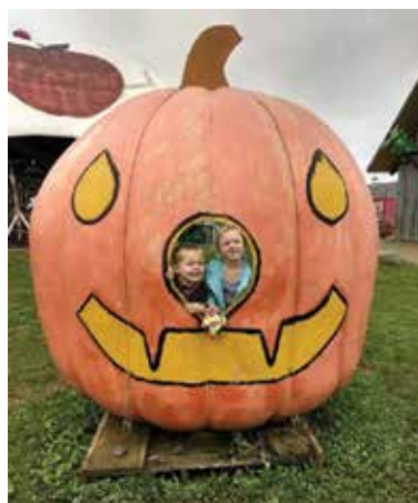
Region 3 enjoyed some fall fun with adoptive families at Klackle Orchards in Greenville.